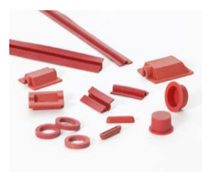
Silicone Rubber Heater Sensor Pockets